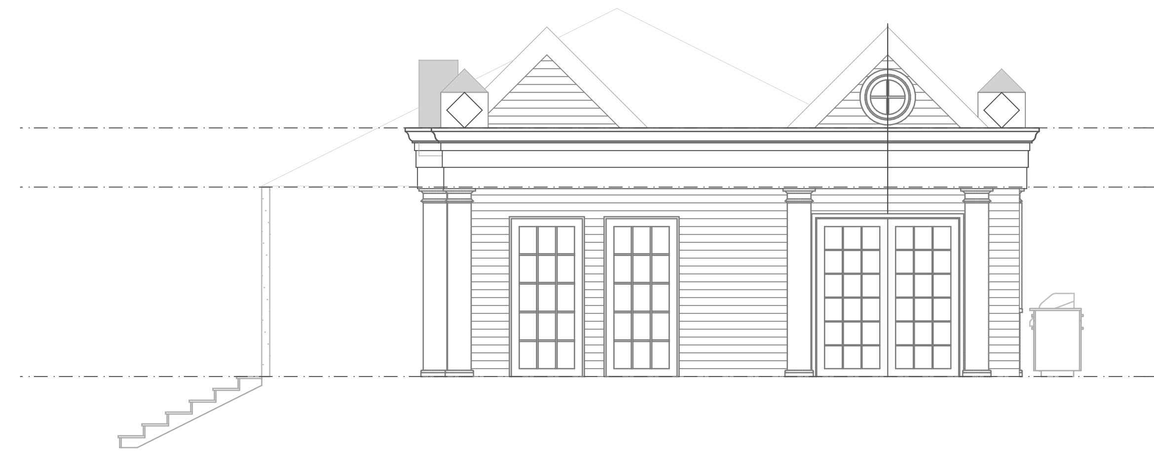
EAST ELEVATION SCALE: 1/4" = 1'-0"