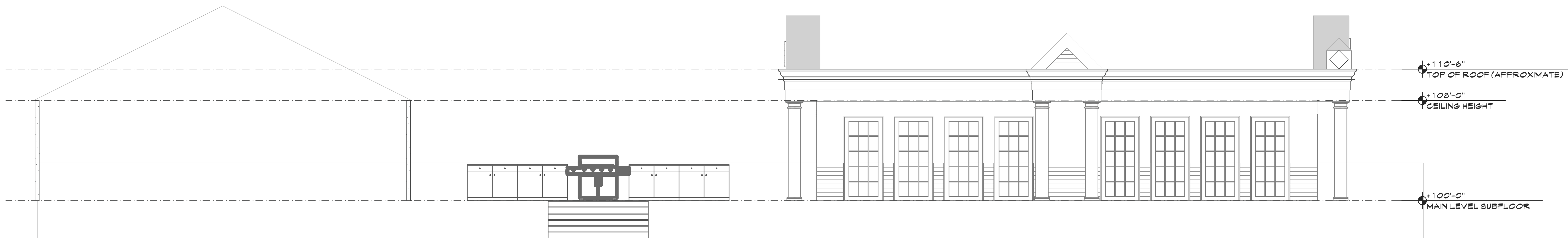
SOUTH ELEVATION SCALE: 1/4" = 1'-0"