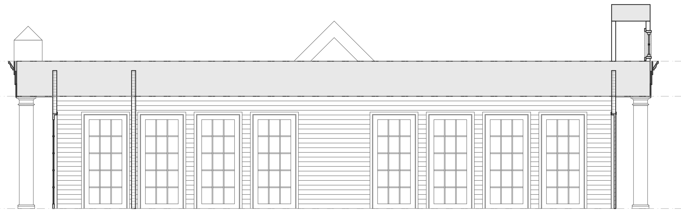
1 SECTION 1/4" = 1'-0"